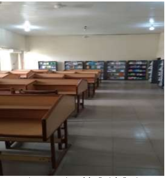
A cross section of the Serials Section