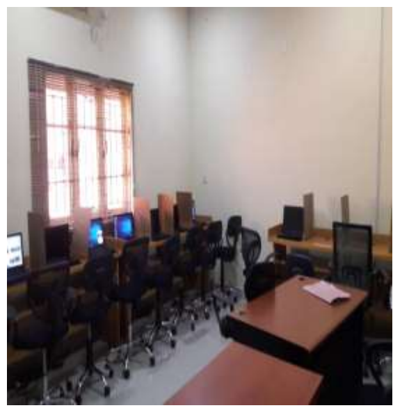
Left wing of Political Sci. Departmental E-library