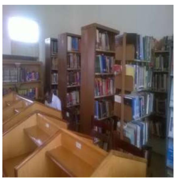
A cross section of the Library Annex