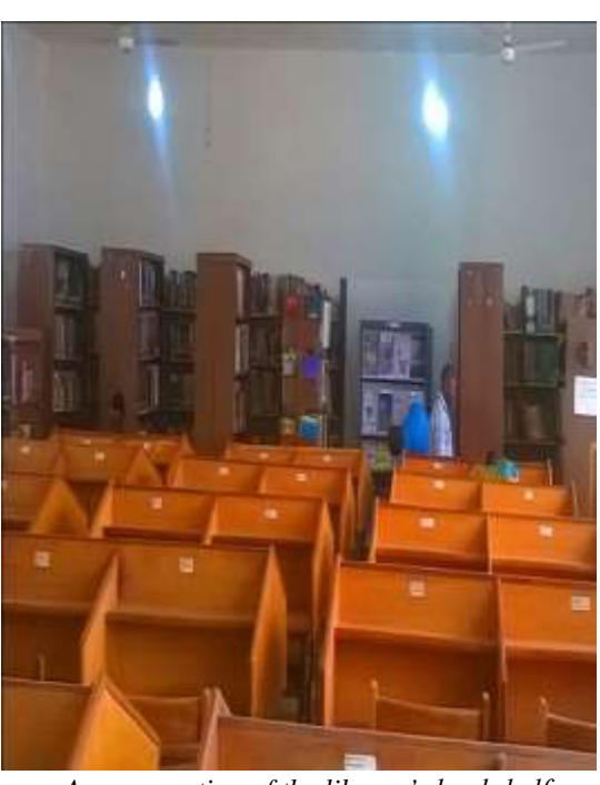
A cross section of the library's bookshelf