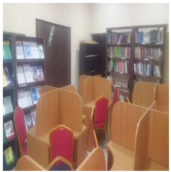
A cross section of Political Sci. Dept. Library