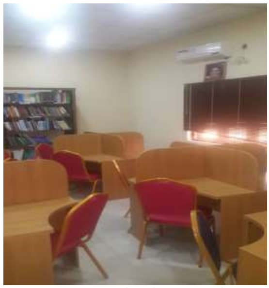
A cross section of Physiology Dept. Library