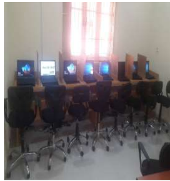
Right wing of Political Sci. Departmental E-library