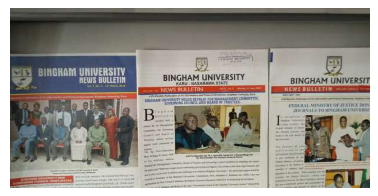
A display of the current and backsets of one of the two publications, in the Serials Section of the library.